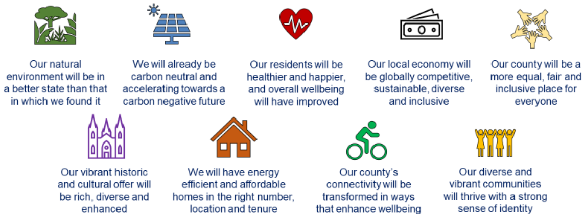
Figure 1: Graphic showing the nine outcomes of the Strategic Vision for Sustainable Development in Oxfordshire.

The Strategic Vision is a non-statutory document. It provides an overarching framework to inform a range of different plans, strategies, and programmes, to drive improvements in environmental, social, and economic well-being and further complements plans and strategies already in place and approved by the FOP and partner organisations.