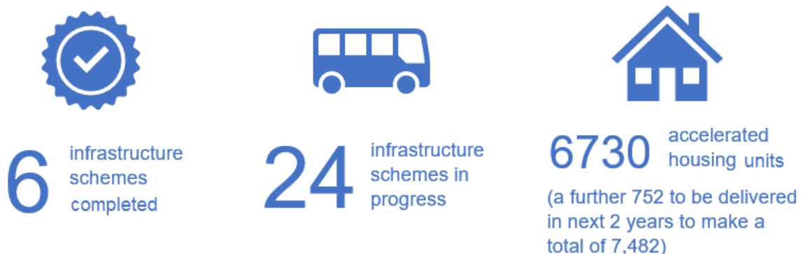
Figure 2: Infrastructure schemes delivered and in progress and associated housing units delivered through the Homes from Infrastructure programme as of 31 March 2023.

Oxfordshire County Council is now accountable for delivery of the remaining programme; a Memorandum of Understanding sets out commitments to positive partnership working, with particular regard to consulting with partners over any proposed changes to the programme of infrastructure delivery.